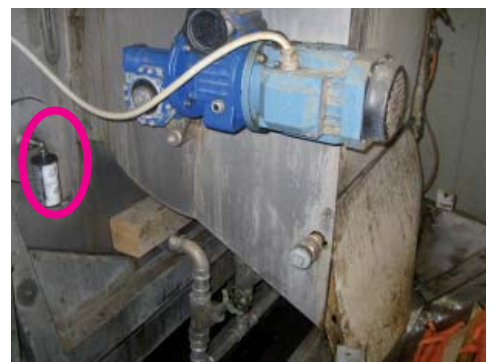
Whilst carrots are being washed, simalube ® lubricates reliably.