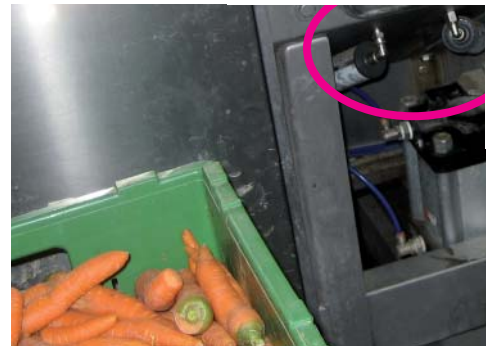
simalube ® is also fully reliable in the food industry.