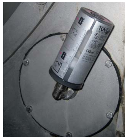
Detailed view of the simalube® during lubrication of the bearings.