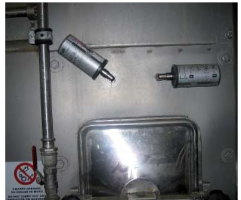
simalube ® lubricates the bearings of the vegetable washing facility.