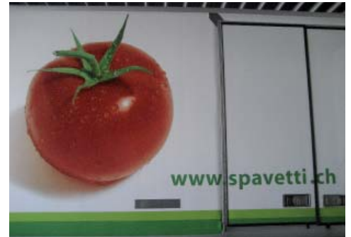
Spavetti AG in Kerzers (Switzerland).

Unforeseen or unplanned machine downtimes are a thing of the past. Thanks to the exact and continuous supply of lubricant, simalube® ensures optimum lubrication. «There is less damage to bearings and longer machine operating times, thus leading to higher production output», explains Ulrich Baumann with great satisfaction.