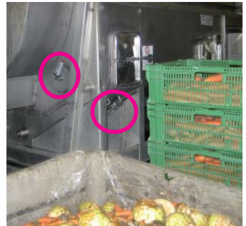
Lubrication of the vegetable washing facility.