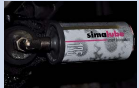
Detail of simalube ® application on the cab