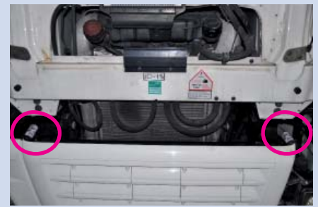
Two simalube ® lubricators mounted on a DAF XF105 Truck