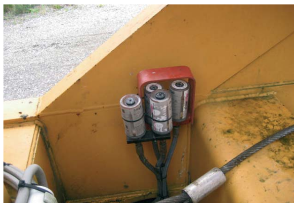
lubrification of cable drum

Crane manufacturers and servicing companies can profit from massive savings in costs for maintenance and spare parts, for the simalube ® lubricant dispenser reduces wear and tear on expensive crane components. The operating life of cranes and derricks is increased through the continuous supply of the required amount of lubricant – in this way heavy duty plants of this kind remain fully functional for longer.