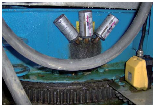
lubrication of the gear ring with simalube