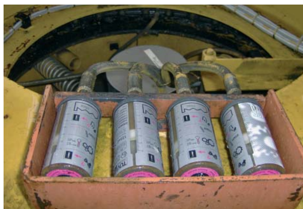
Safety and protection picture for simalube